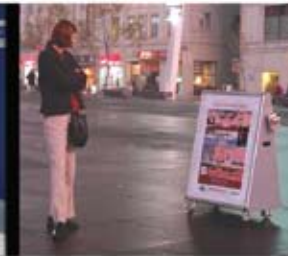
Custom Clipframes on a mobile display in the Toronto city centre (municipality)