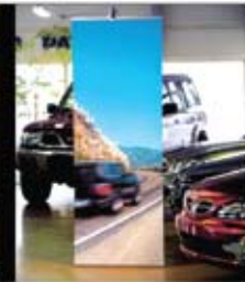
Banner Stand in a store - showroom (car dealership)