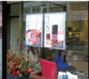
Poster Light Classic in a shop window (spa)