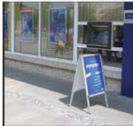
Clipframes in a shop window and A-board on sidewalk (banking)